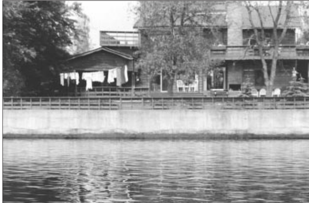
Artificially altered shorelines reduce runoff-filtering capacity and increase sediment suspension from wave action.