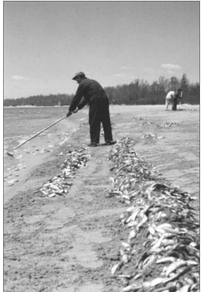
Changes in water quality can have serious consequences. Thousands of fish can die due to toxic spills or depletion of oxygen.

Boating can disturb sediment settled on the bottom of lakes and rivers. Reducing speeds in shallow waters and in areas with soft bottoms can help prevent this problem. Reducing speeds near shore will also decrease shoreline erosion from wave wash. Always use a marine pumping station to dispose of black water from toilets and grey water from showers, baths, washing machines and dishwashers. Never discharge black or grey water overboard. Be cautious when refuelling and remember to fill portable tanks on shore, away from the water.