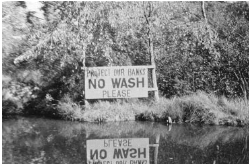
Boaters have an important role to play in protecting water quality.